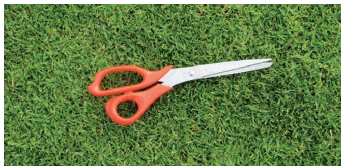
Fig 2. Eureka Premium VG Kikuyu grassed area.