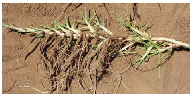
Fig 3. Close-up of live stolon.